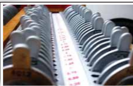
A photograph taken by a visually impaired participant

The workshop illuminated a new line of thought, distinct from the way we approach photography – it demystified the polarity between blindness and visual expression by celebrating the human spirit of self-expression. It also spread awareness about the challenges and capabilities of the visually impaired and delivered the message that diminished visibility does not mean diminished life. The workshop empowered visually impaired photographers by instilling a sense of pride in their accomplishments; elevating their self-esteem as well as helping them develop social and workplace skills.