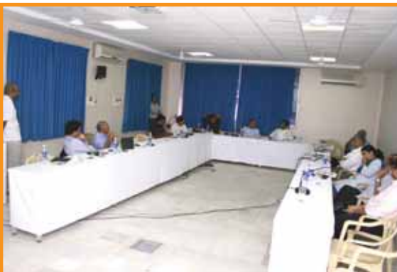
Apex Body meeting with SEF Board