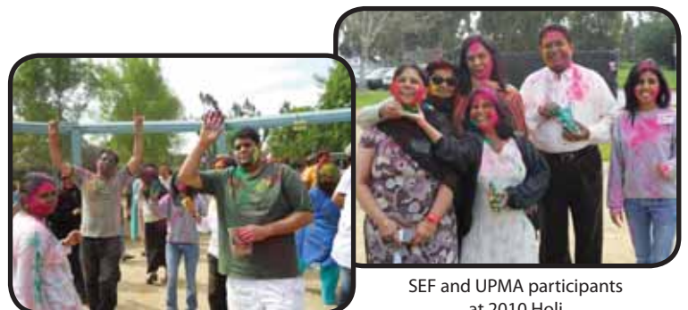
SEF and UPMA participants at 2010 Holi

Please join us and become a Founding Donor; get your name or that of your loved one on the Wall of Founders at the UP Hospital