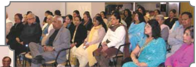
Patrons of Sunshine Seniors Association listening to SEF's Vision

SEF would like to grow all over the country, especially Tri-State and Southern California Please share your vision and help us reach Vision 20/20 Contact info@giftofvision.org with your ideas