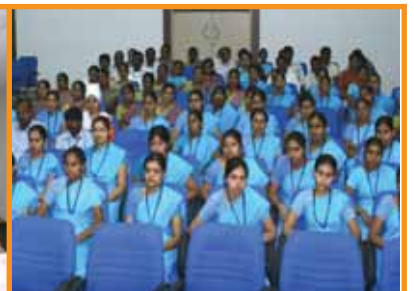
Punjab girls in training - preparing for Punjab Hospital opening in 2012

SEF, USA Board Members recently attended a week-long meeting in Coimbatore with the SECI Apex Body and Mission for Vision representatives to review the strategy of Vision 20/20 by 2020. We, at Sankara are committed to continuous improvement, and thus, have established a quality assurance team that is chartered with conducting periodic audit and inspections of our operations. Further, we have standardized operations across all our hospitals, enabling us to effectively replicate and scale. Video conferencing facility has been added to all our hospitals to enable us to better share our practices and for specialists at various hospitals to share opinions and knowledge. We use a balanced scorecard approach that evaluates varied dimensions of our operations: marketing, training, surgeries, accounting, human resource, and community outreach –to name a few.