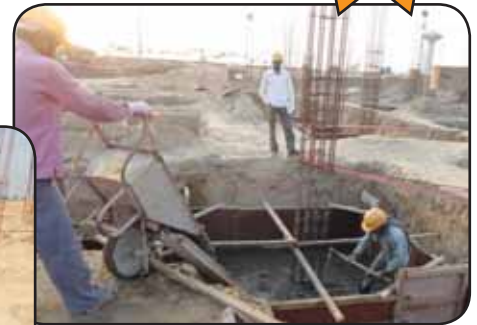
Construction of the Sankara Eye Hospital, Ludhiana, Punjab