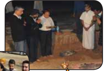
Bhoomi Puja Ceremony

The hospital construction is in full stride; the paramedical staff for the hospital is in training at the head quarters in Coimbatore and equipment is being purchased; all in preparation for the hospital to be inaugurated in March 2012. We are on the last leg of fundraising and need only $900K to complete the Punjab project. We are grateful for your support and request your continued support to complete this project.