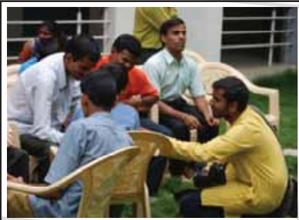
Participants interacting at the Beyond Sight Workshop

World Sight Day is an annual day of raising awareness and global attention of the world's blind and visually impaired and is held on the second Thursday in October. This past World Sight Day on October 14, 2010, Sankara Eye Hospital, Bangalore, in collaboration with Beyond Sight Foundation, Mumbai, presented "Beyond Sight Workshop 2010" - a unique workshop on teaching photography to the blind.