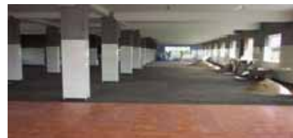
"Savithri Waney Wing"