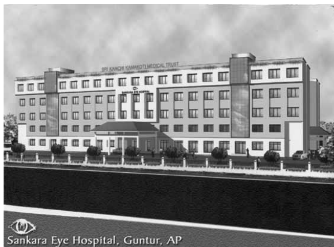
Sankara Eye Hospital, Guntur, AP